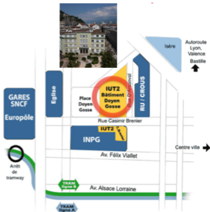
Bâtiment Doyen Gosse 2, place Doyen Gosse - 38031 GRENOBLE Grenoble Gare (Tram)